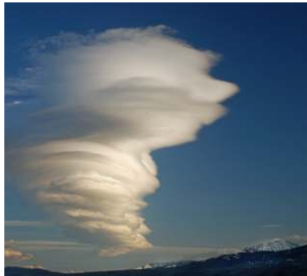
View from the Socrates Circle